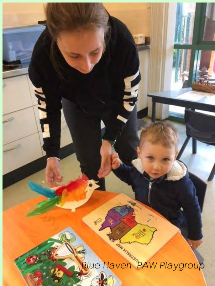
Blue Haven PAW Playgroup