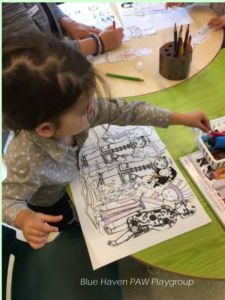
Blue Haven PAW Playgroup

Playgroup sessions are now running online every week due to COVID-19 restrictions on the Central Coast. More families are joining in each week making it a great way for everyone to catch up with each other and keep connected during the lockdown.