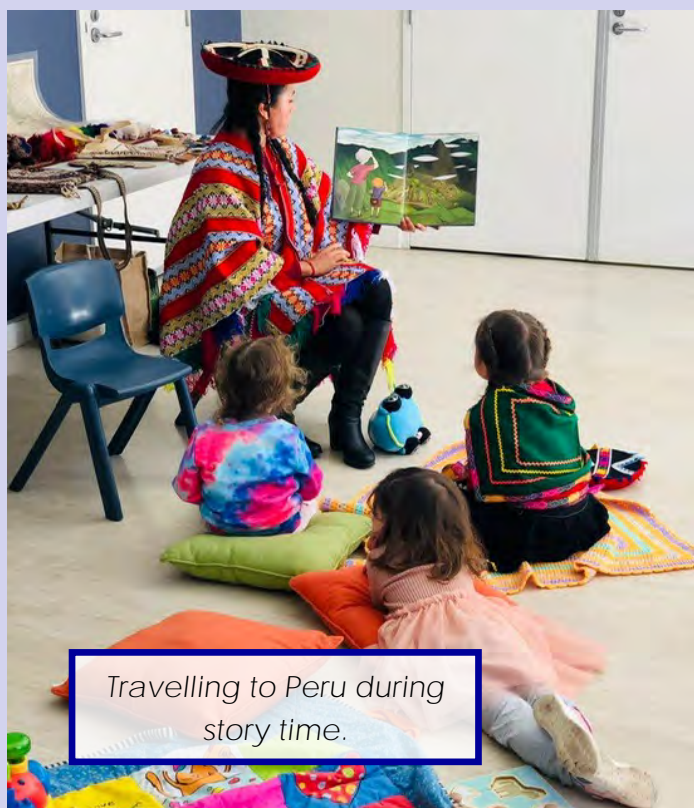
Travelling to Peru during story time.