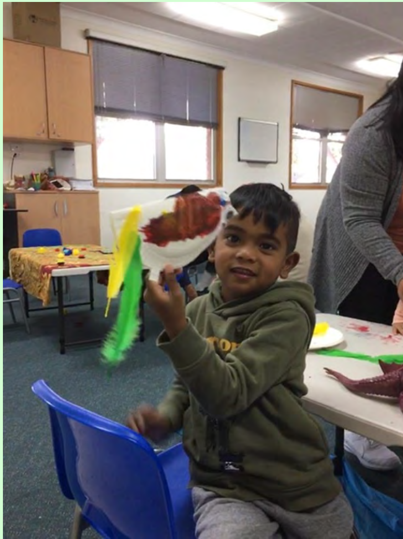
Left: The Entrance Playgroup And Below: Messy play at Blue Haven Playgroup