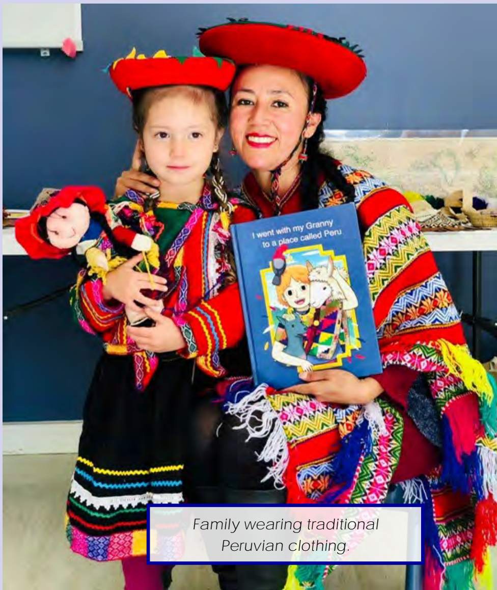
Family wearing traditional Peruvian clothing.