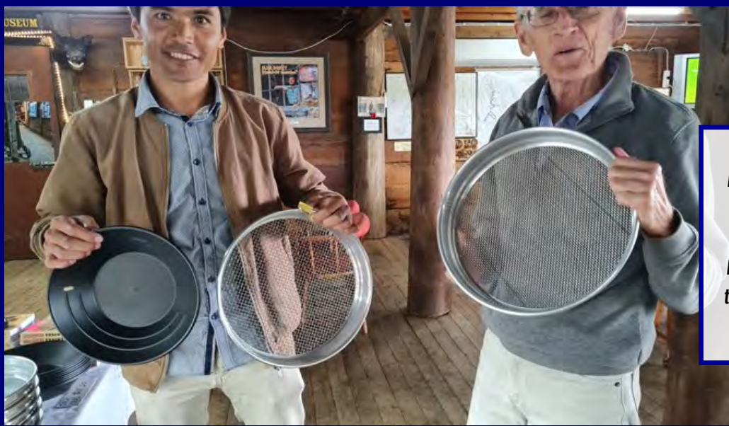
Nundle is a gold mining town. Locals and fossickers still find gold nuggets here. This sift is what the amateurs use for gold panning