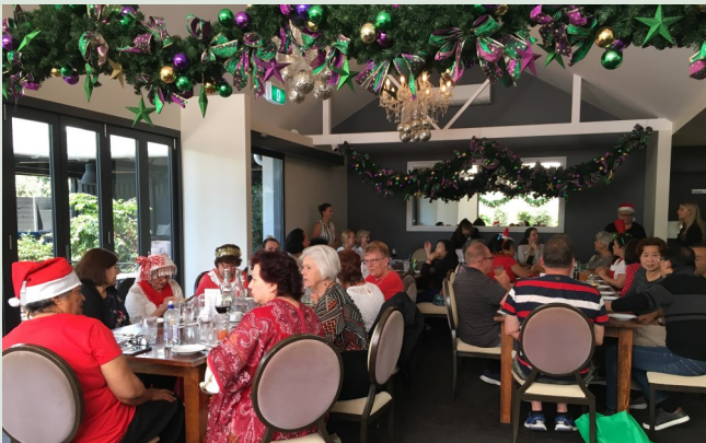
Right: Santa was kept busy handing out the presents to Volunteers.