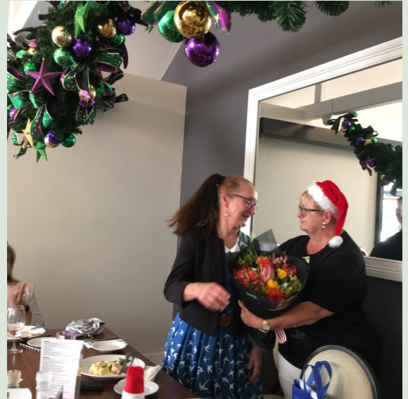
Left: Aged Care team volunteers enjoying their Christmas lunch.