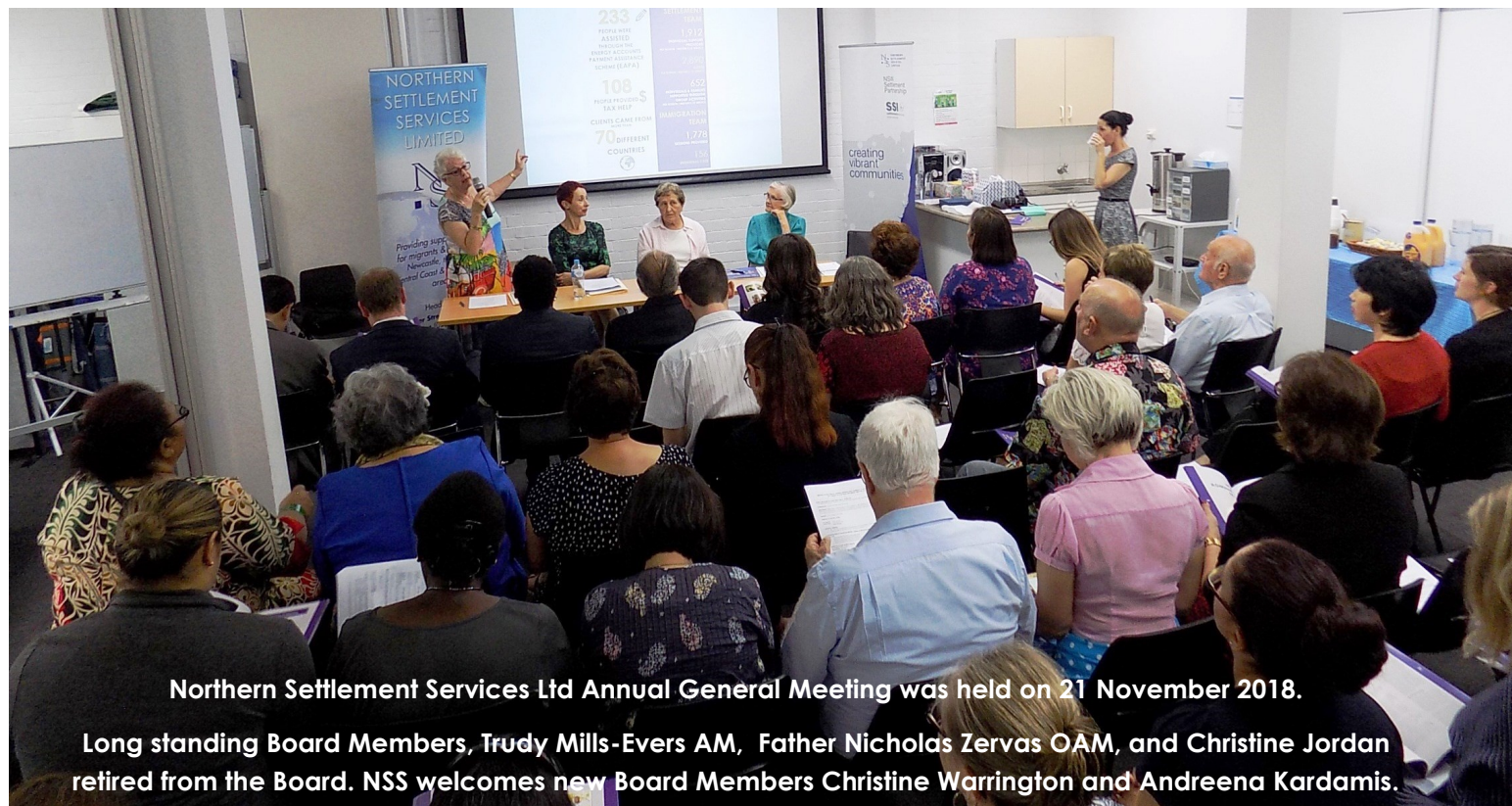
Northern Settlement Services Ltd Annual General Meeting was held on 21 November 2018.