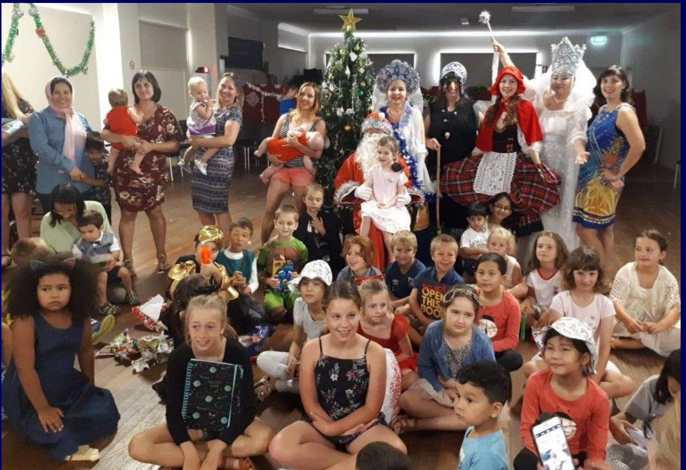
Multicultural Parents Group End Of Year Celebration