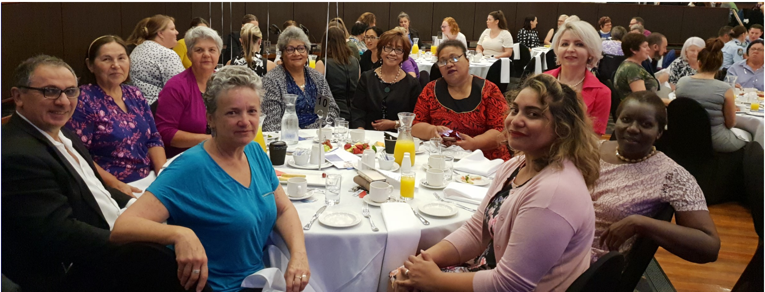
NSS Staff and Board Members attended a White Ribbon Breakfast event at Wests New Lambton to help prevent violence against women.